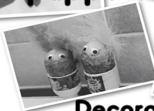
Decorated boiled egg