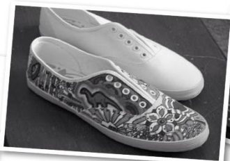
Decorated shoe or boot