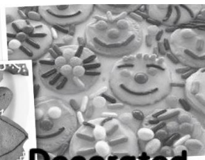
Decorated Marie biscuits